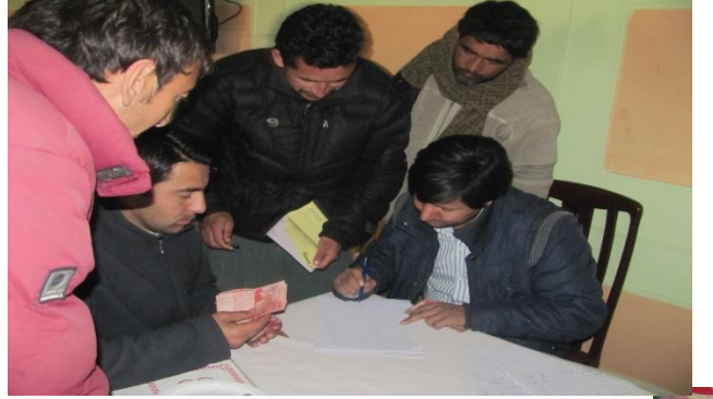
Figure 2. Distributing Travel Allowances to Participants During a Training Session in CHIP

knowledge of accounts, administration and finance. This provided him basic understanding to practically apply the theoretical knowledge by means of modern methods and technologies. He also learnt the ethics of office environment which helped him enhance and refine his leadership qualities.